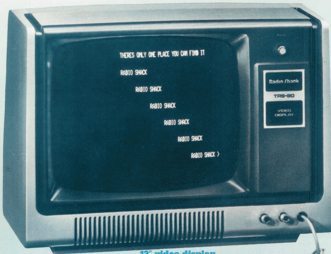
12" video display