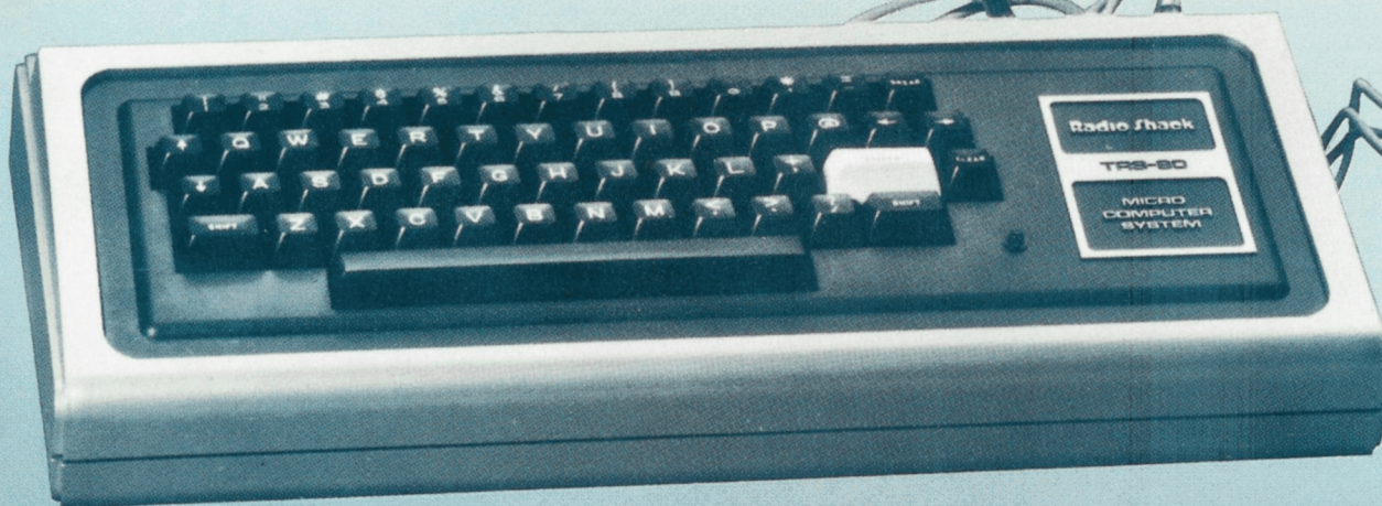
Computer with built-in keyboard